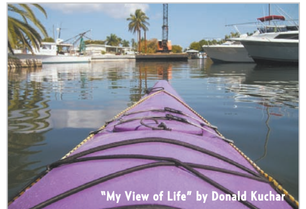
"My View of Life" by Donald Kuchar

Ongoing: Take a photo while on the Calusa Blueway Paddling Trail and submit it for Shooting the Blueway photo contest. Check out guidelines at www.calusabluewaypaddlingfestival.com and e-mail entries to gulfspirit@comcast.net by Oct. 1, 2009. Contest is free with prizes awarded. (239) 433-3855.